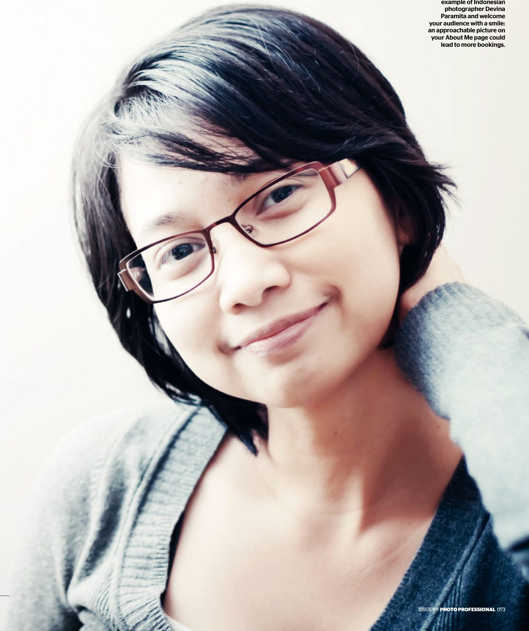
IMAGE Follow the example of Indonesian photographer Devina Paramita and welcome your audience with a smile: an approachable picture on your About Me page could lead to more bookings.

Prospective clients want to know about you. If you don't offer them a professional presentation of yourself, you'll miss out. Here eight professional photographers, who haven't missed out, share their experiences of creating their own About me pages, pictures and videos. →